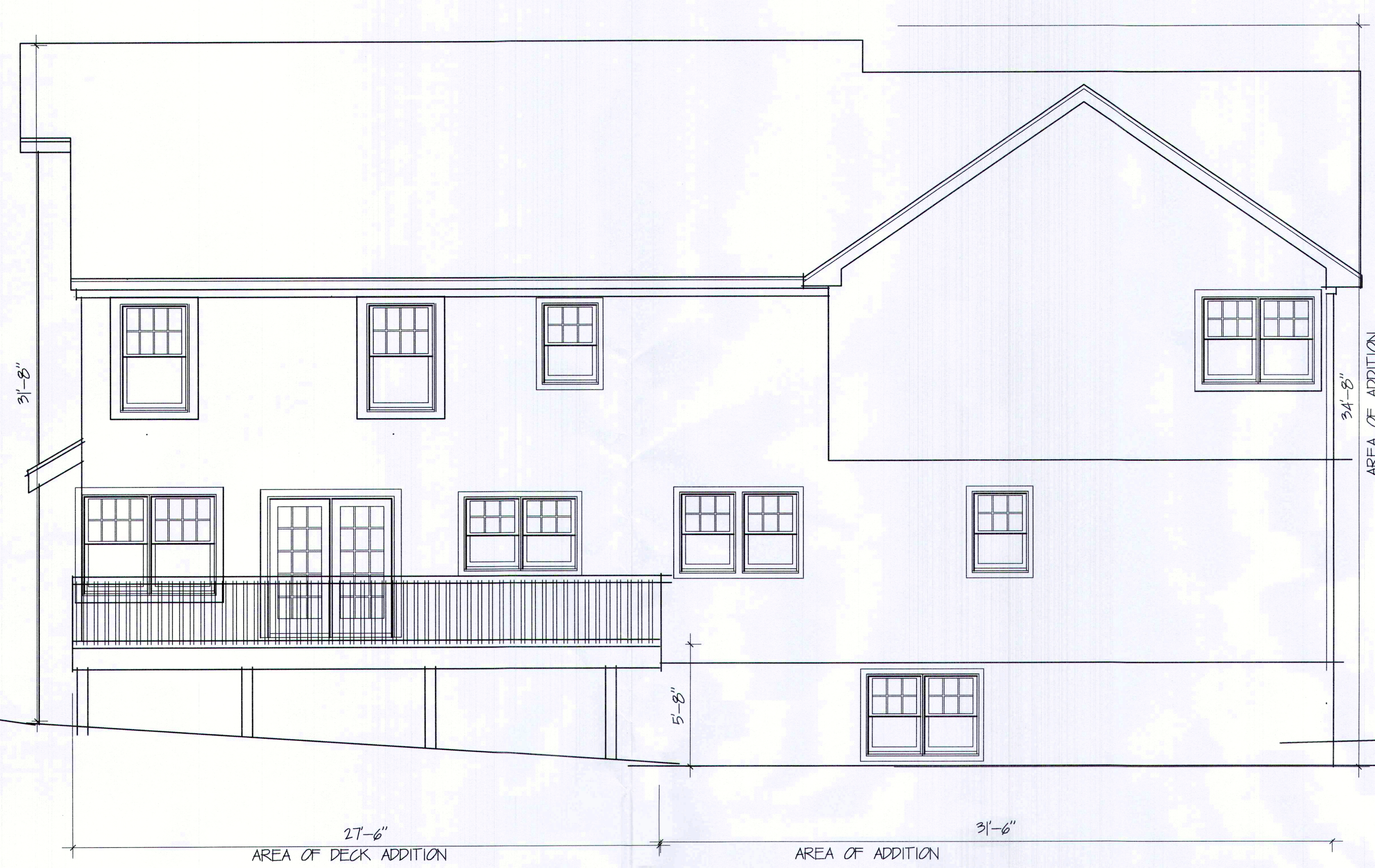
REAR ELEVATION SCALE 1/4" = 1'-0"

DATE 6-01-21 JOB NUMBER 15-41 DRAWN CM CHECK SHEET A-2 5